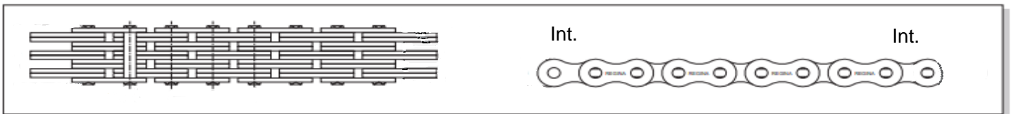
Catena lifter terminali esterno - esterno